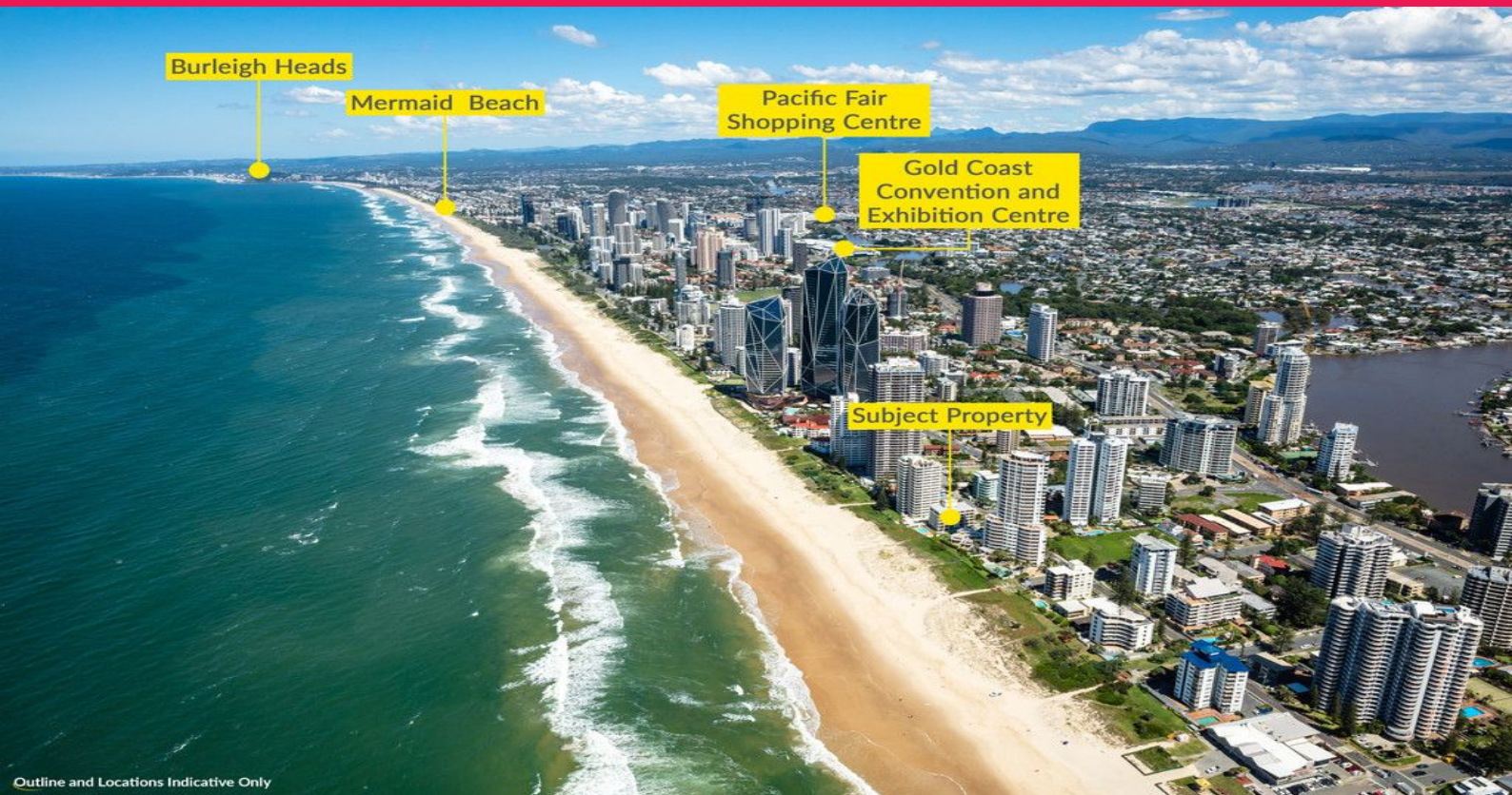
Outline and Locations Indicative Only