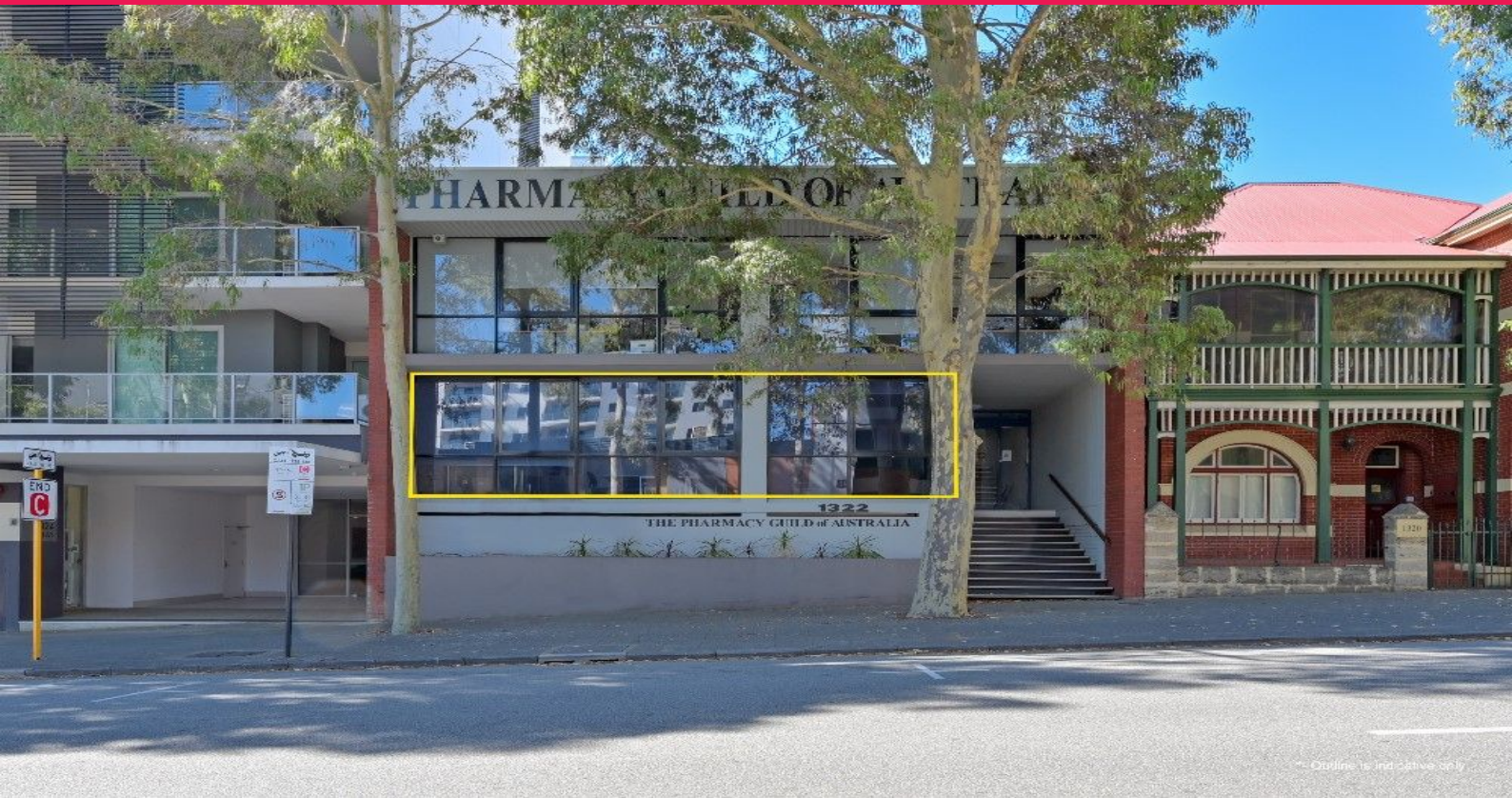
Outline is indicative only