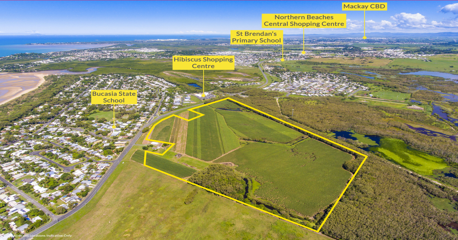
Outline and Locations Indicative Only