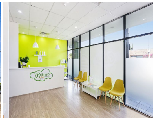
Shop 4/324 William Street, KINGSGROVE