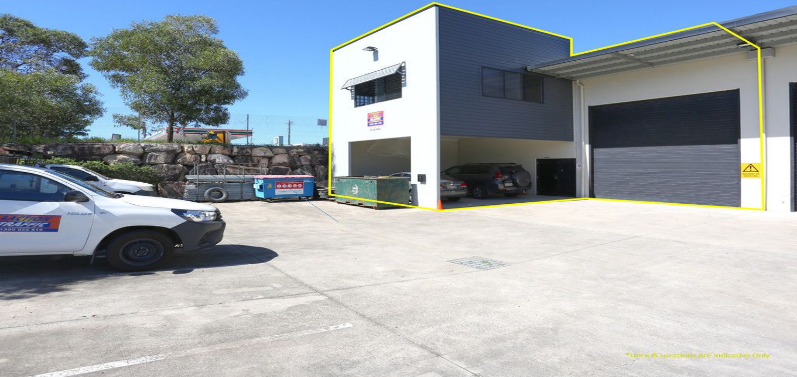
*Lines & Locations Are Indicative Only