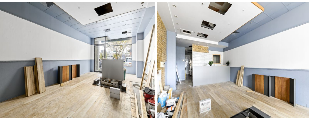
1/520-528 VICTORIA STREET, NORTH MELBOURNE