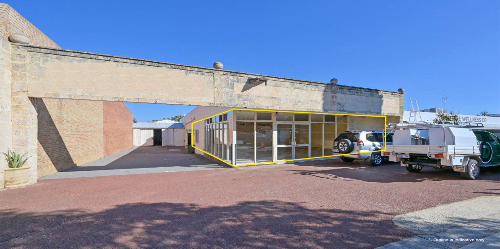
* Outline is indicative only