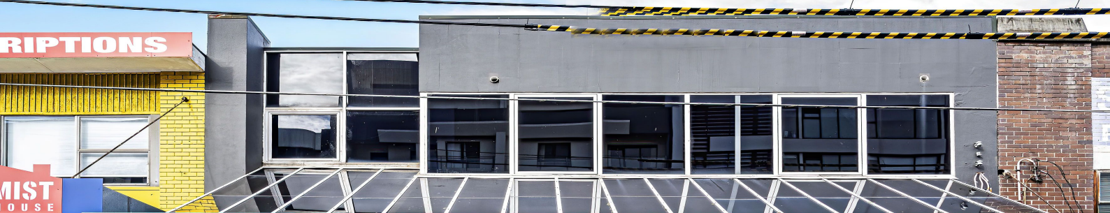
Southeast Sydney Veterinary Hospital