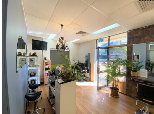
3/18 Pickwick Street, Cannon Hill QLD 4170