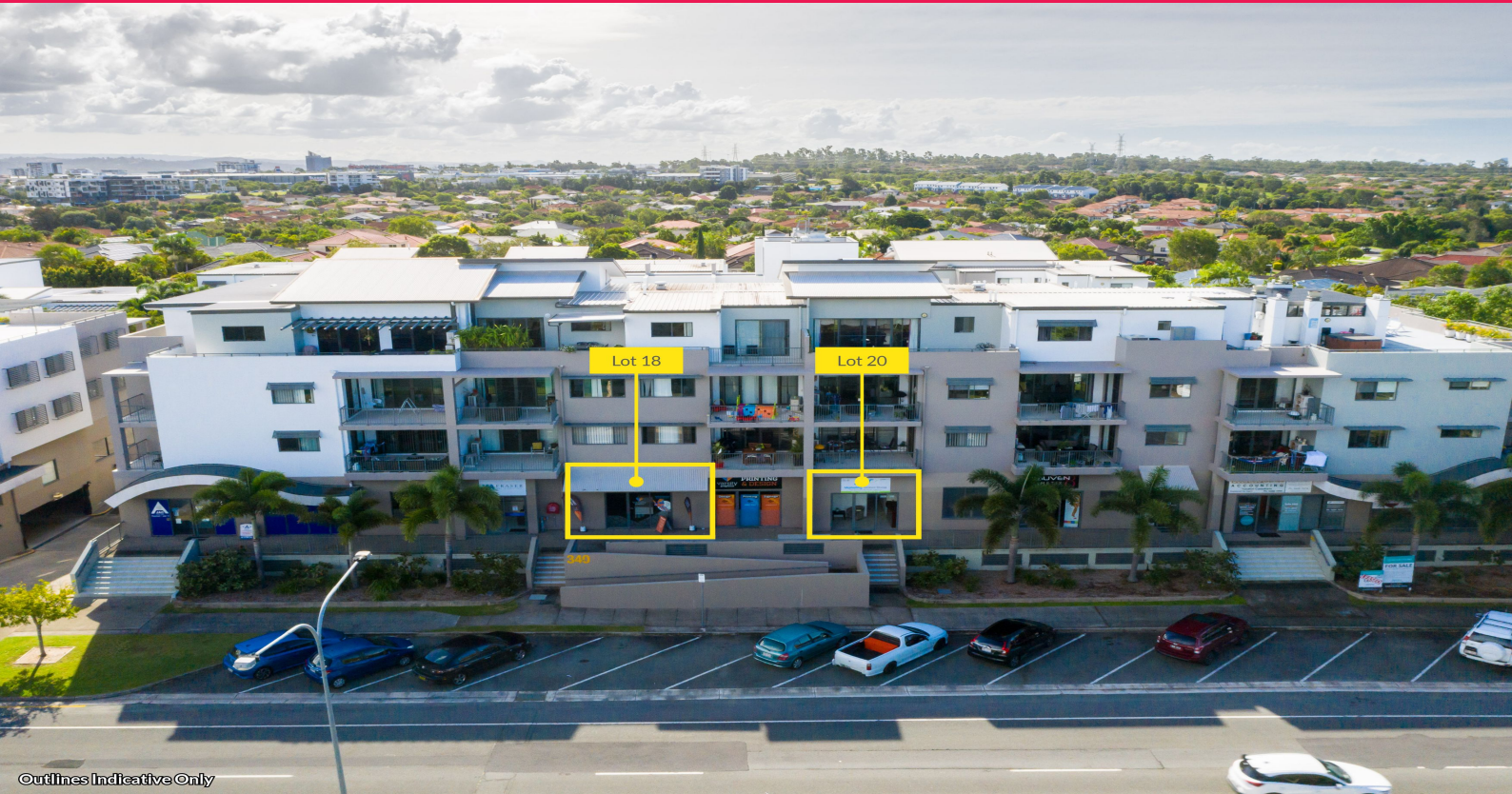
Outlines Indicative Only