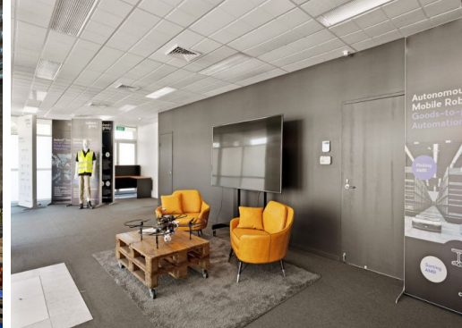
1/2-4 Sarton Road, Clayton VIC 3168