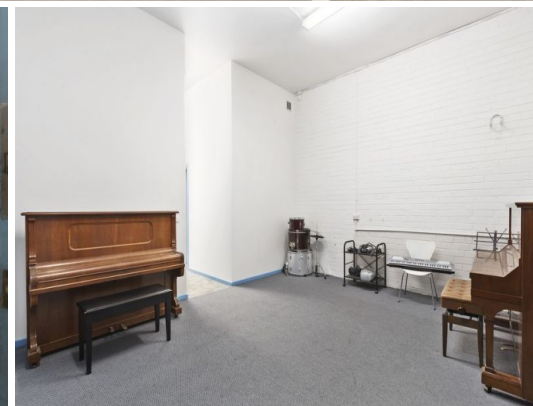
9A SALISBURY AVENUE, BLACKBURN