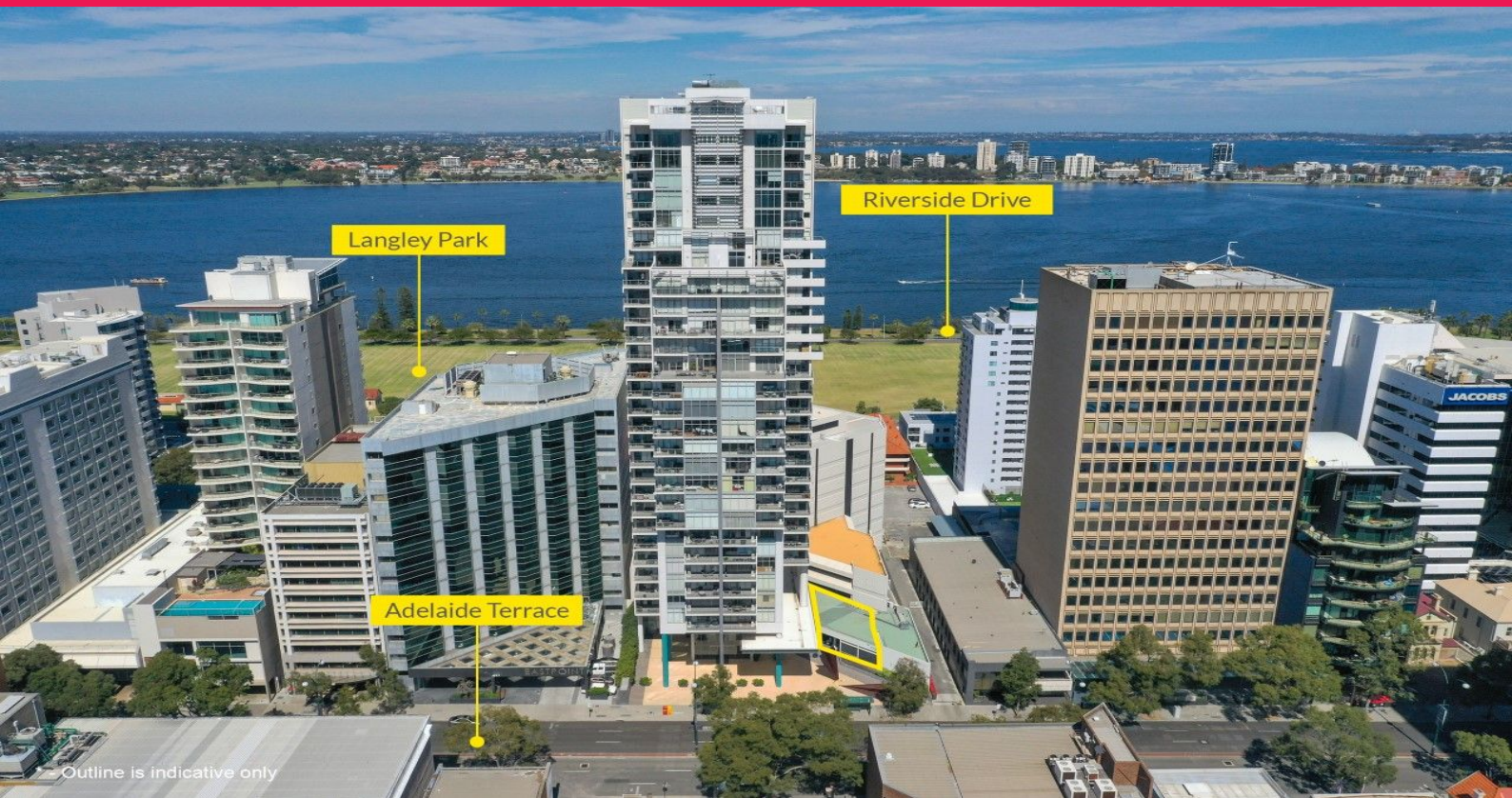
Outline is indicative only