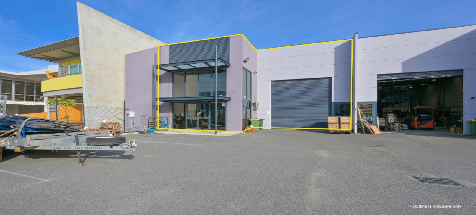
*- Outline is indicative only