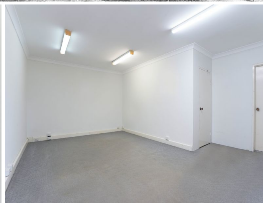
Suite 10/99 South Creek Road, Cromer