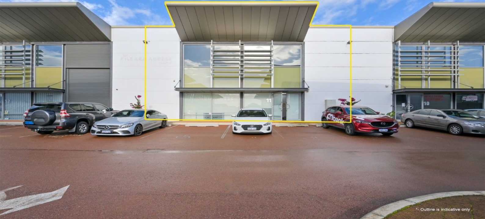
*- Outline is indicative only