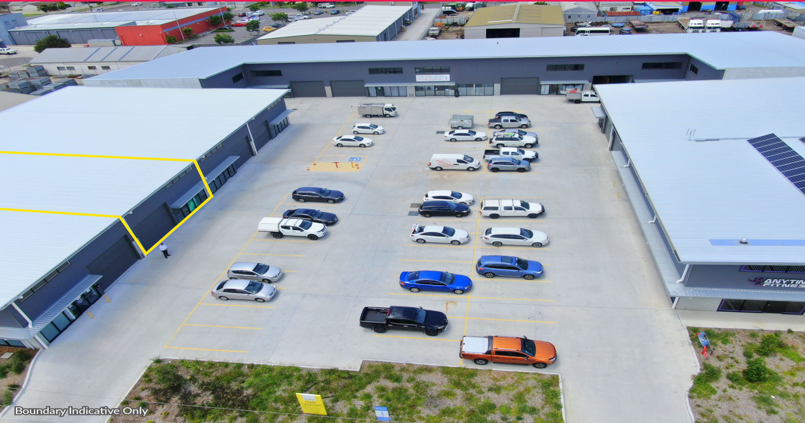
Boundary Indicative Only