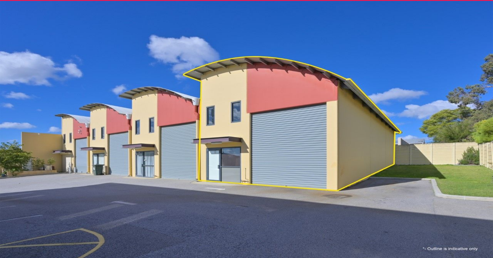
*- Outline is indicative only