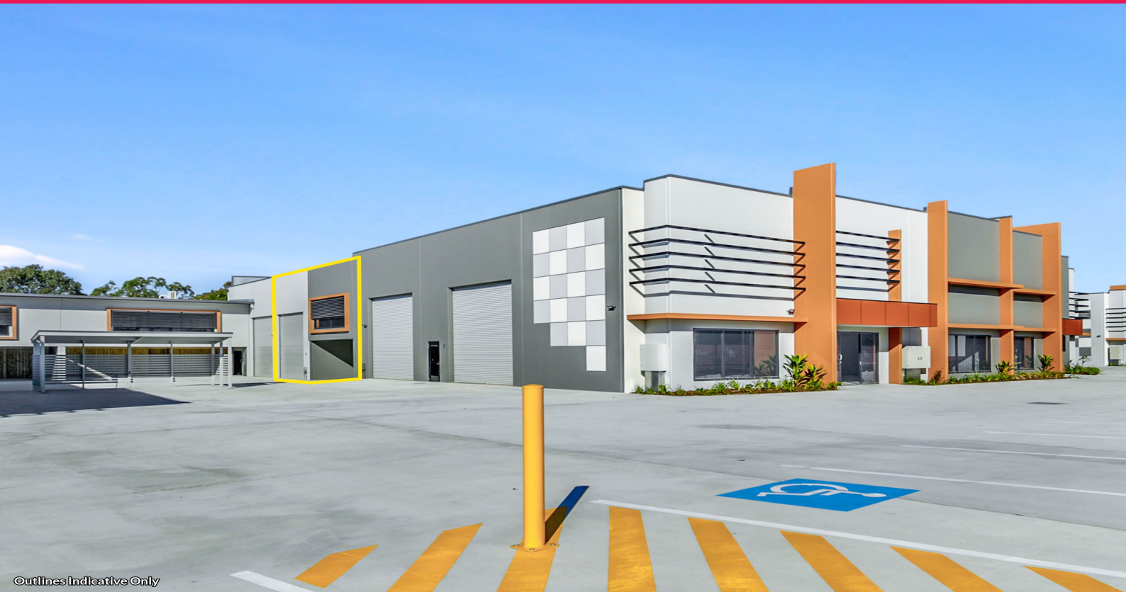
Outlines Indicative Only