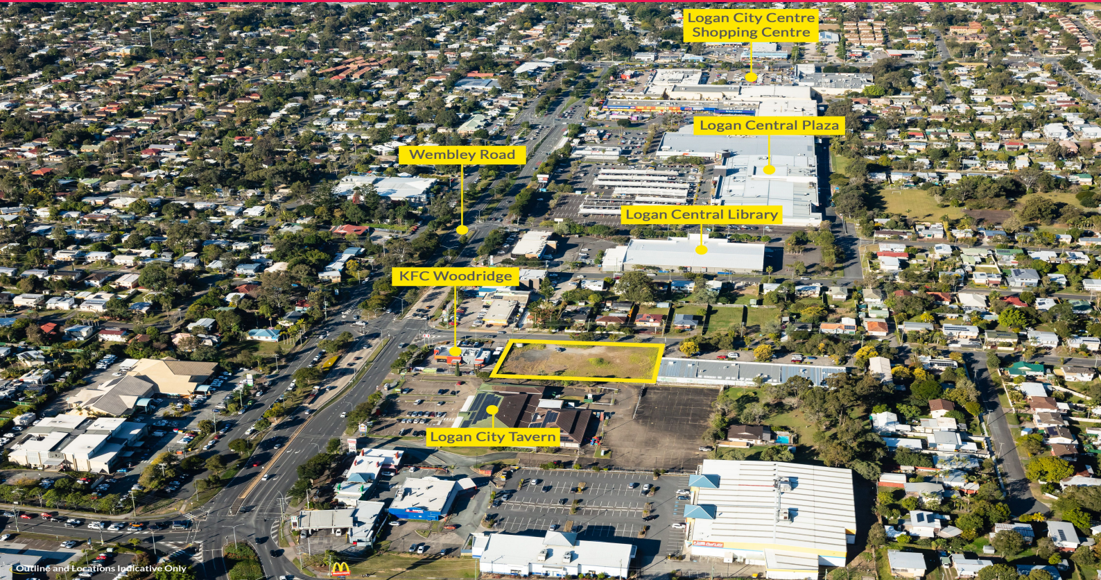
Outline and Locations Indicative Only