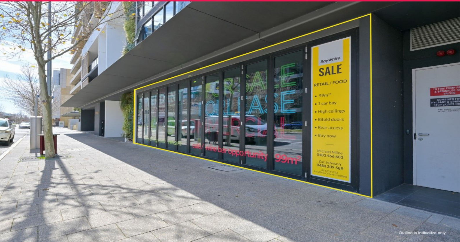
*- Outline is indicative only