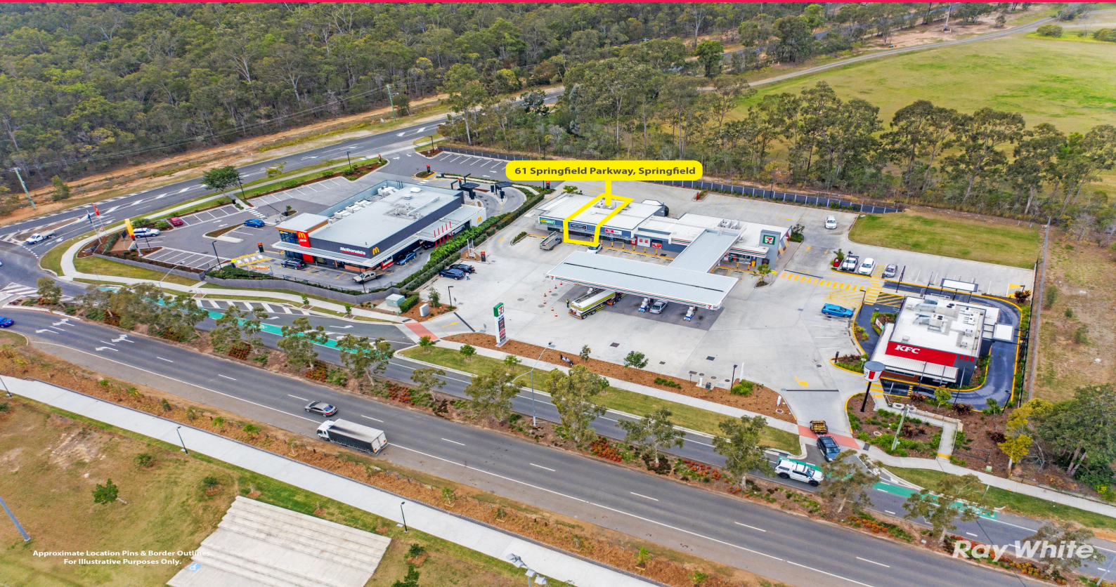
Approximate Location Pins & Border Outlines For Illustrative Purposes Only.