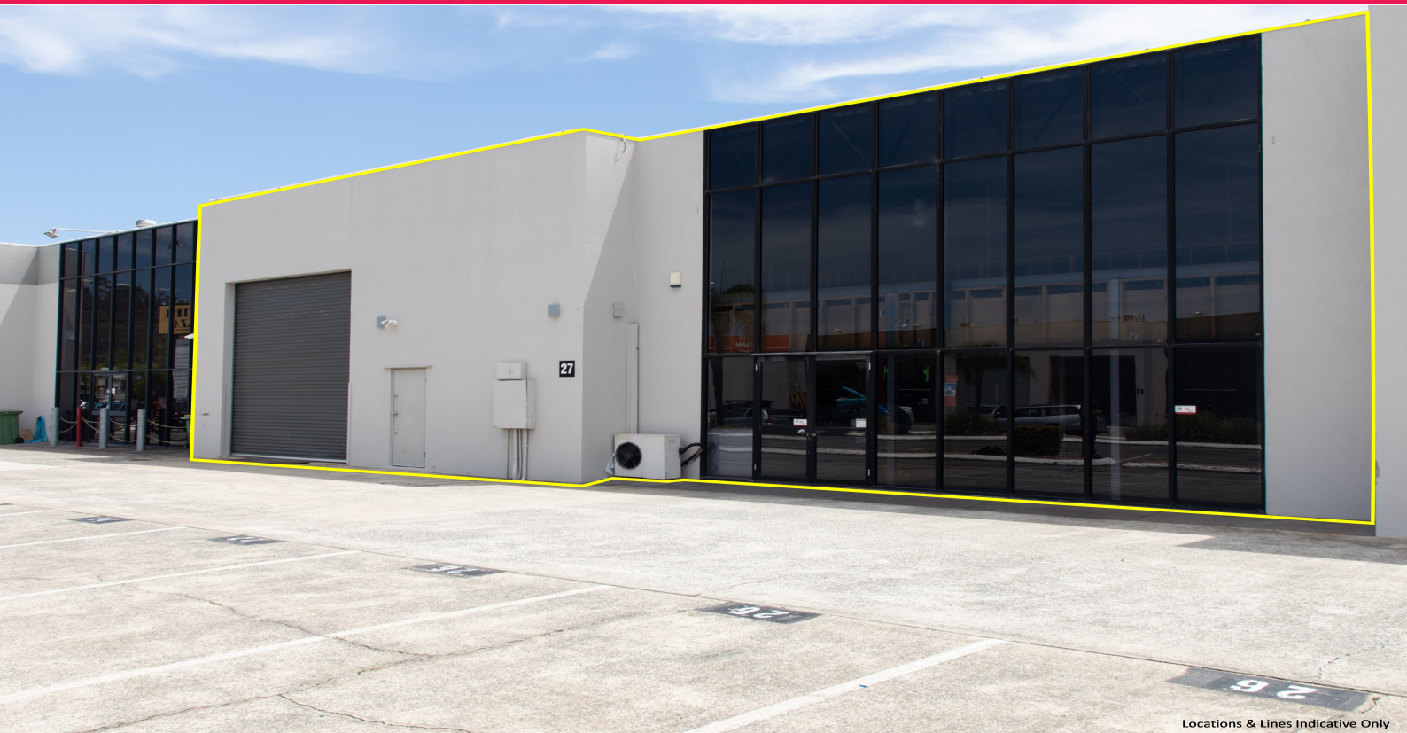
Locations & Lines Indicative Only