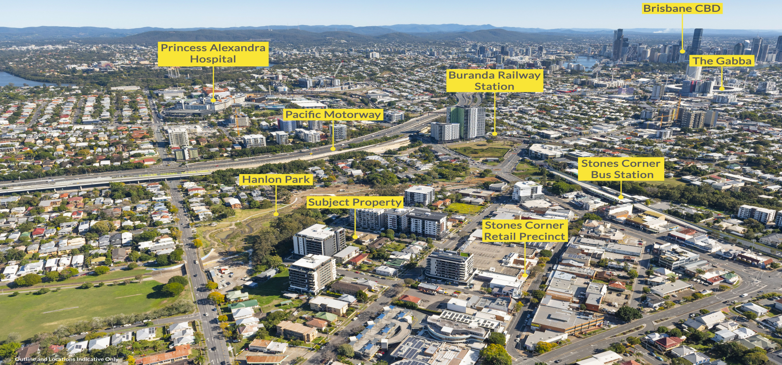
Outlines and Locations Indicative Only