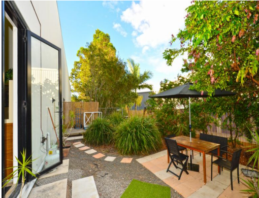
Unit 5/21 Production Street, Noosaville QLD 4566