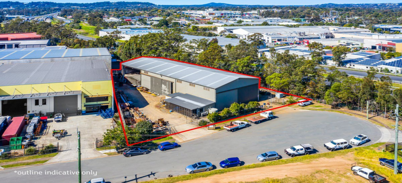
*outline indicative only