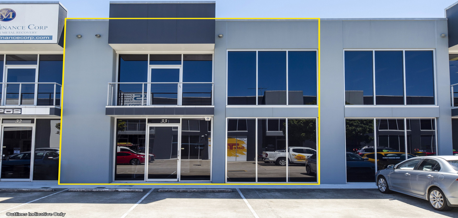
Outlines Indicative Only