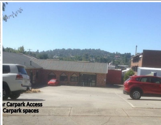
Rear Carpark Access Carpark spaces