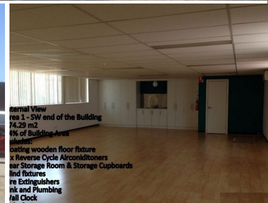
Internal View Area 1 - SW end of the Building 74.29 m2 6% of Building Area Includes: - Polishing wooden floor fixture - 2 x Reverse Cycle Airconditioners - 2 x Storage Room & Storage Cupboards - 2 x Sink fixtures - 2 x Fire Extinguishers - 1 x Sink and Plumbing - 1 x Wall Clock