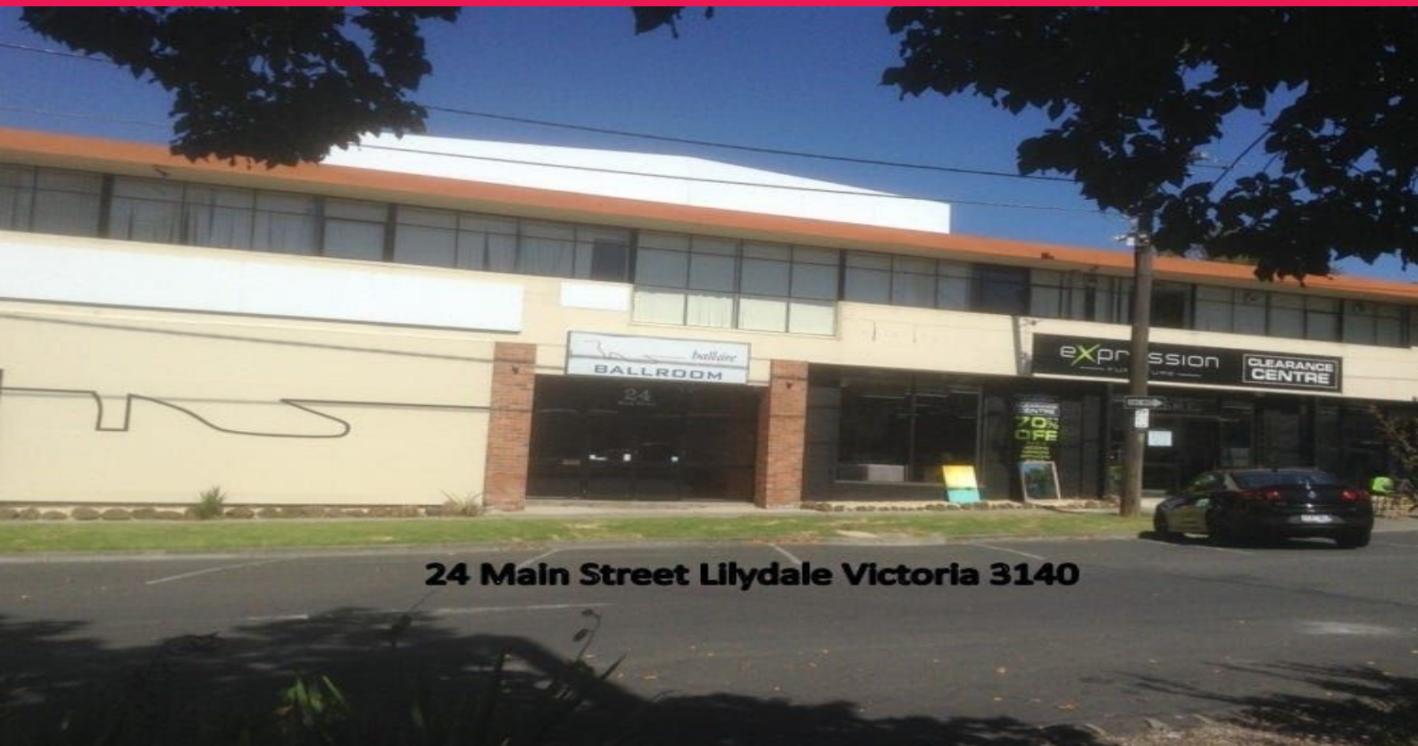
24 Main Street Lilydale Victoria 3140