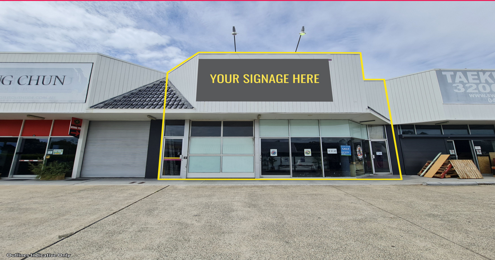
Outlines Indicative Only