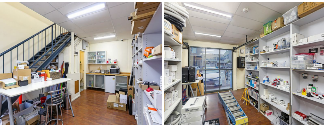
15/56 Orlordan Street, ALEXANDRIA