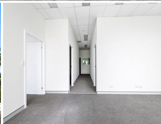
COURTYARD & BUILDING 1 LOBBY