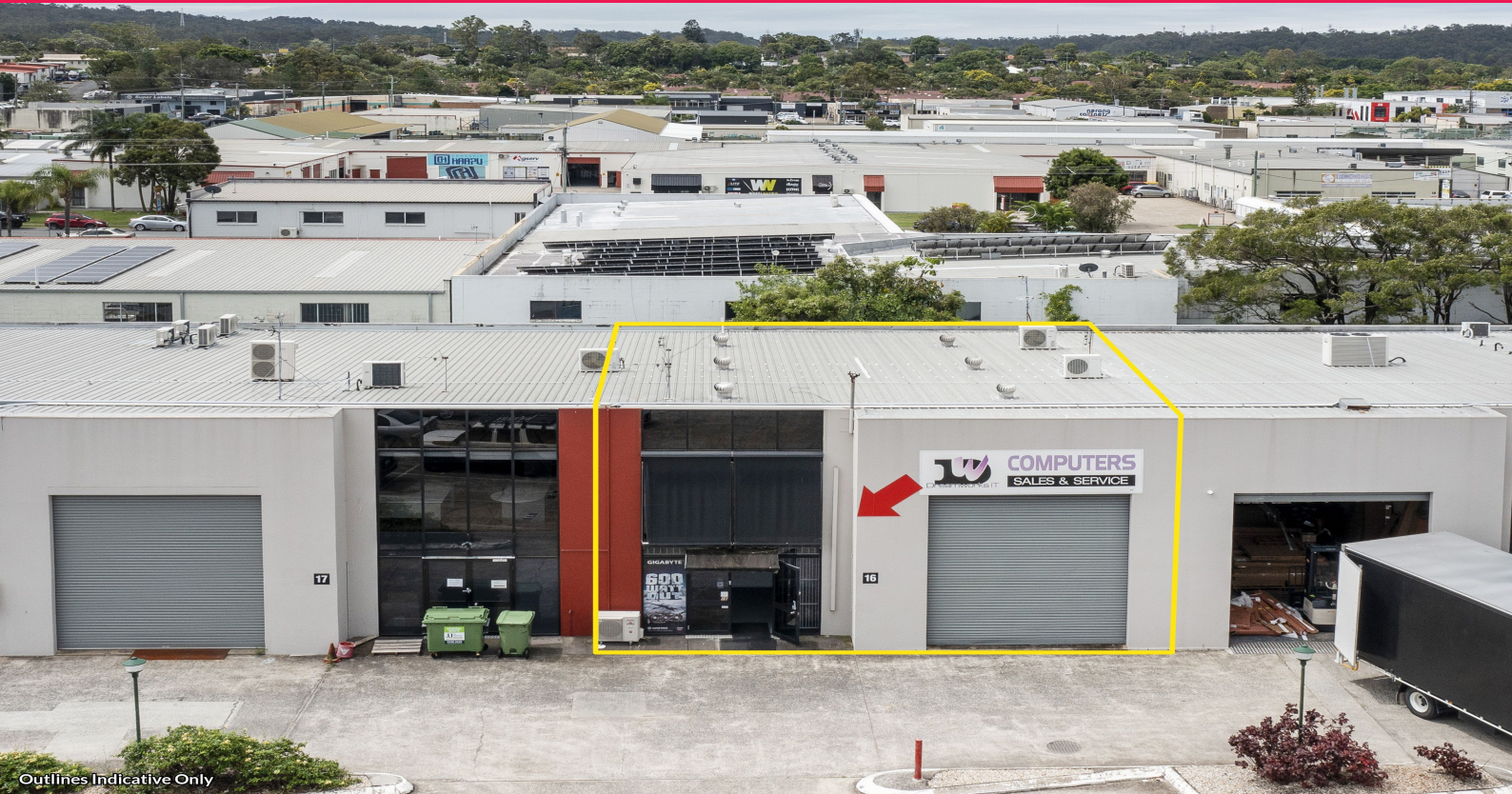
Outlines Indicative Only