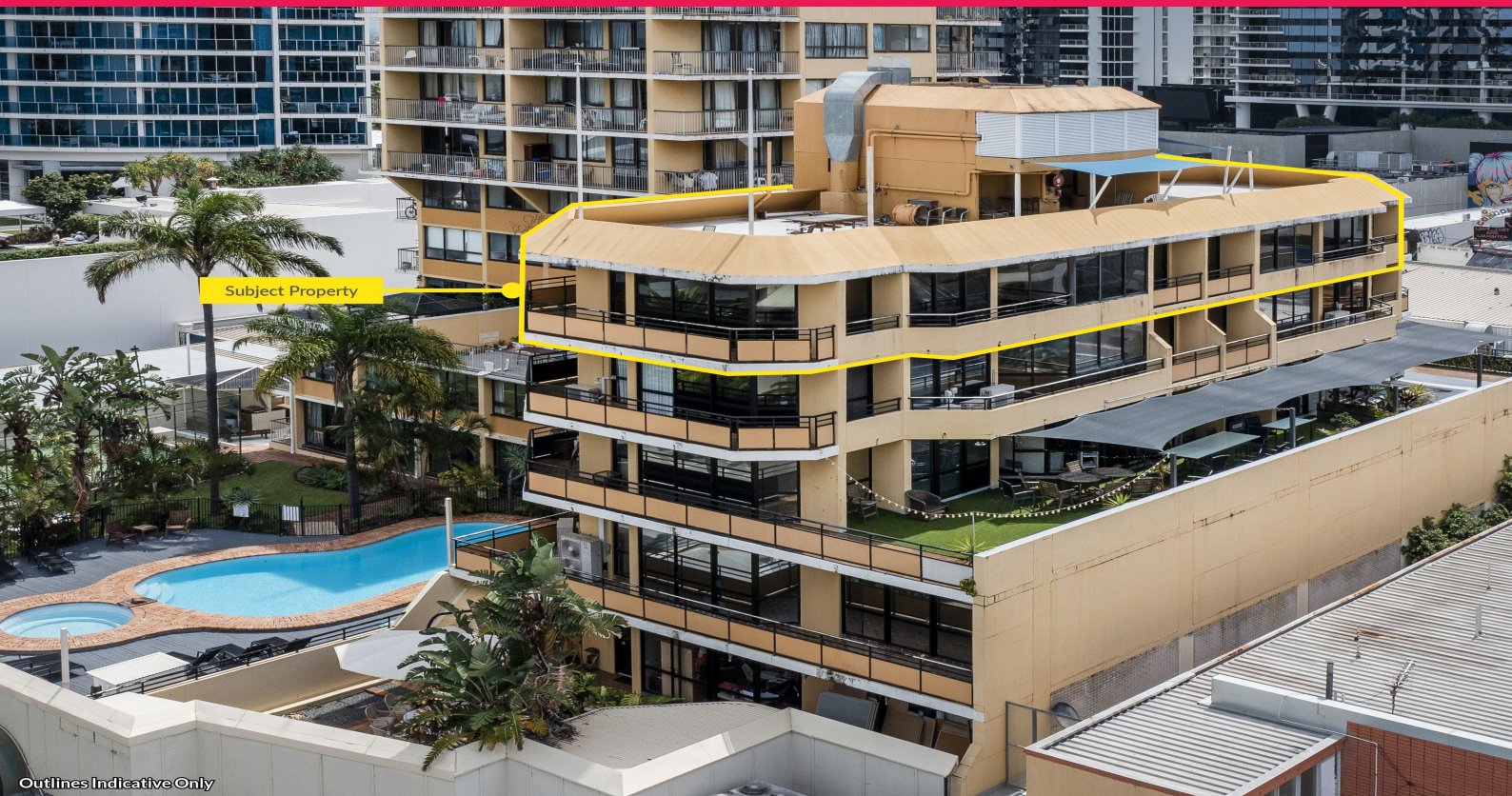
Outlines Indicative Only