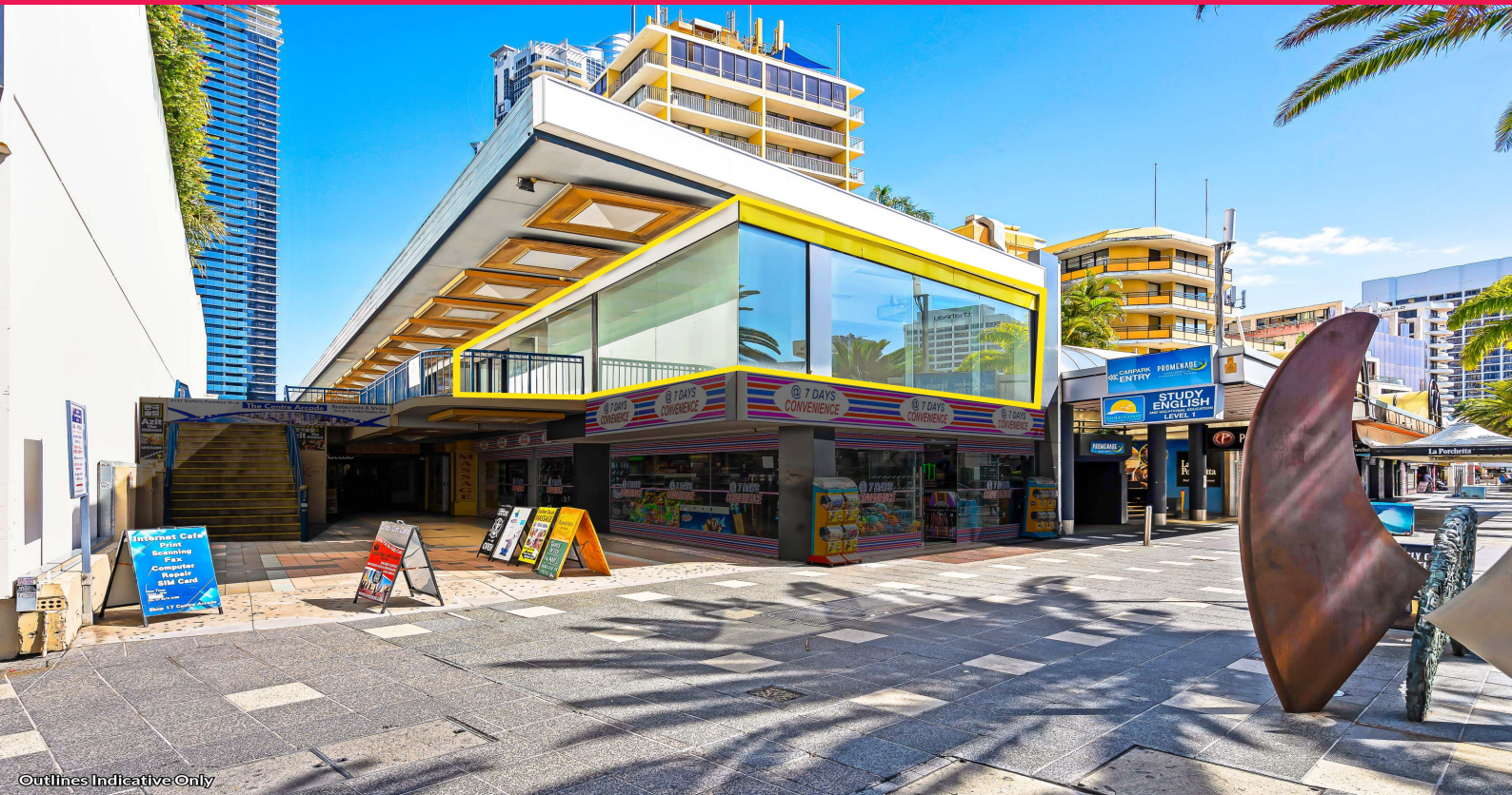
Outlines Indicative Only