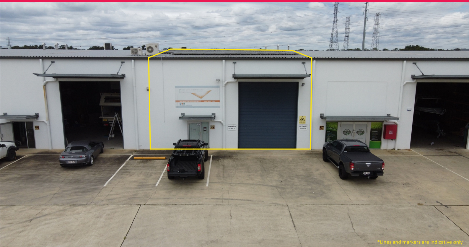
*Lines and markers are indicative only