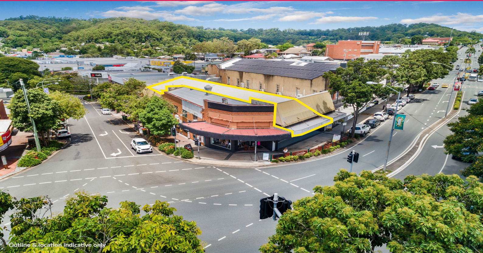
Outline & location indicative only