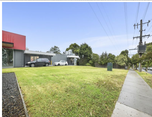
820 DONCASTER ROAD, DONCASTER