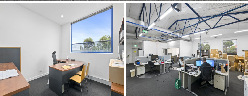
1/726 HIGH STREET, KEW EAST