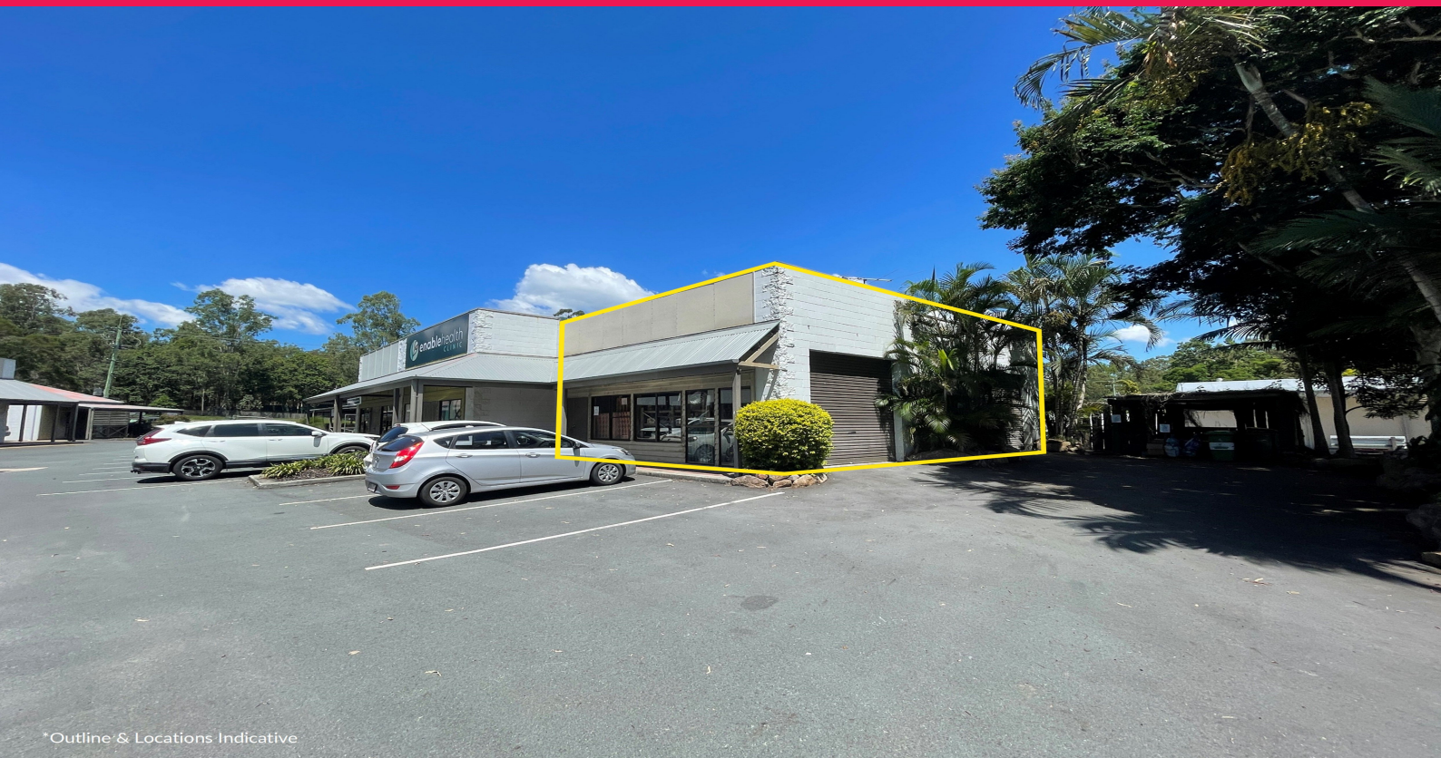
*Outline & Locations Indicative