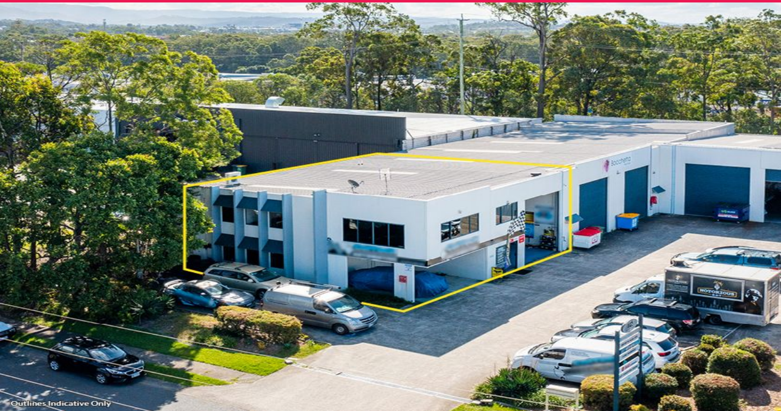
Outlines Indicative Only