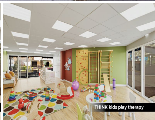
THINK kids play therapy