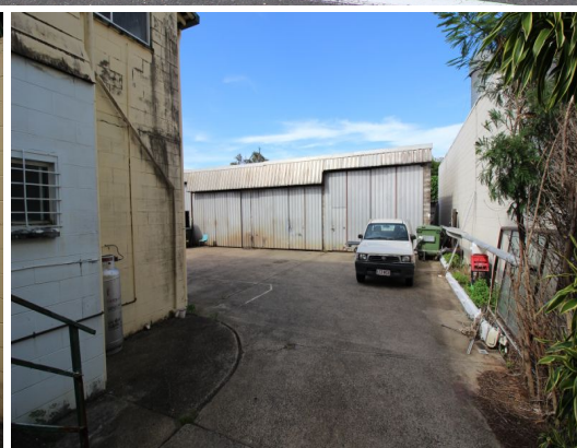
236-240 Severin Street, Parramatta Park