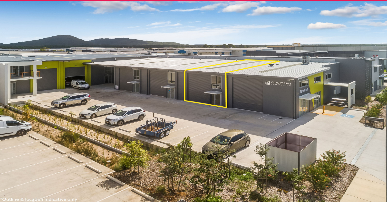
*Outline & location indicative only