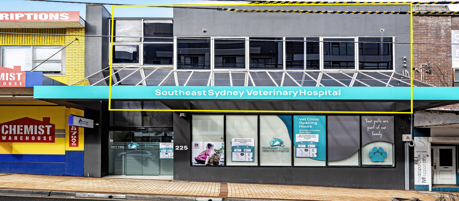
Southeast Sydney Veterinary Hospital