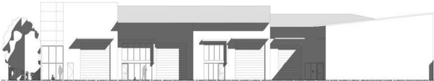
2 NORTH ELEVATION 1:100