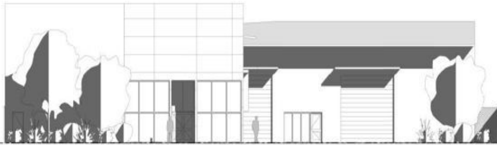
1 EAST (STREET) ELEVATION 1:100