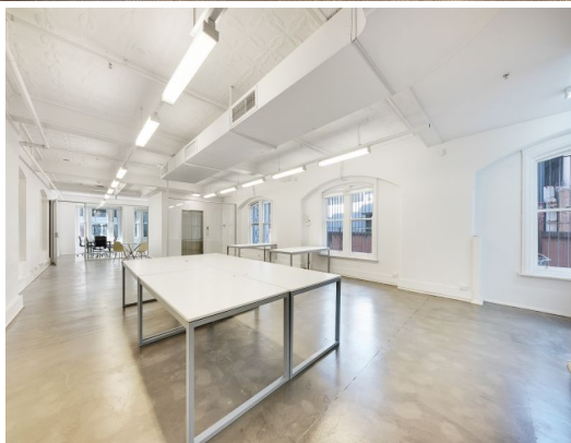
387 George St Lapad types 2