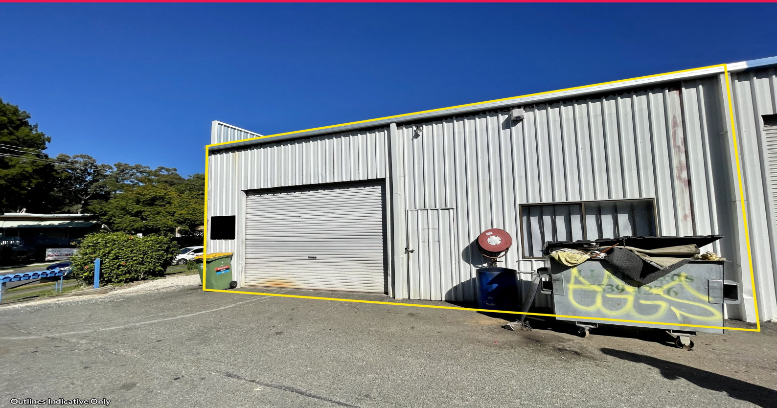
Outlines Indicative Only