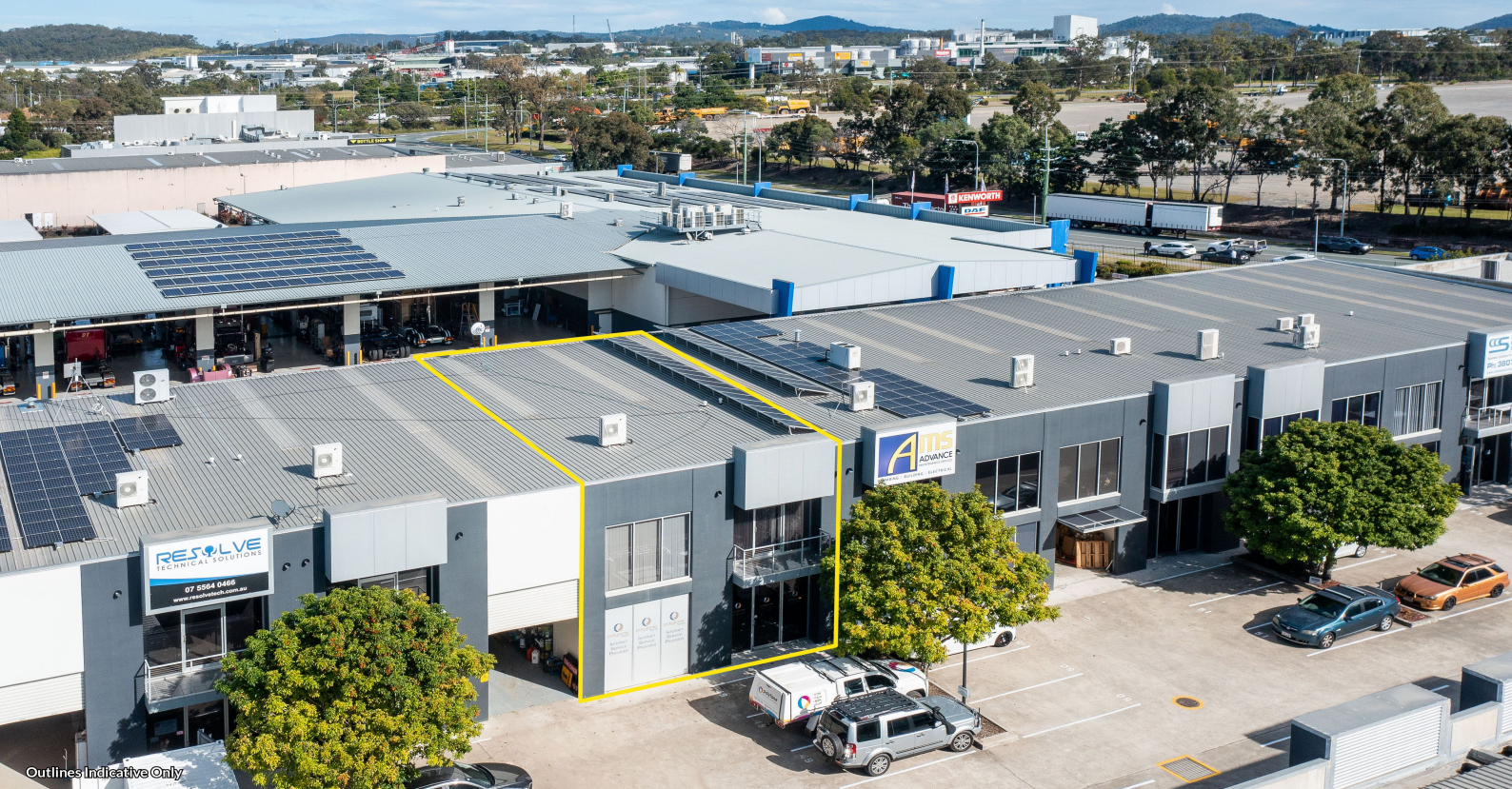
Outlines Indicative Only