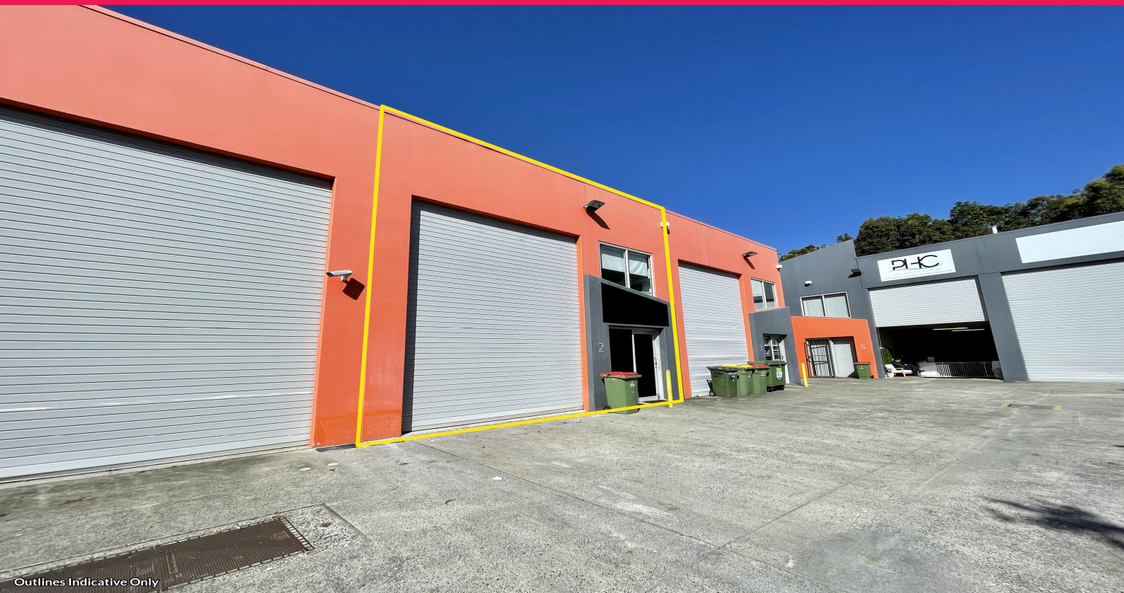
Outlines Indicative Only