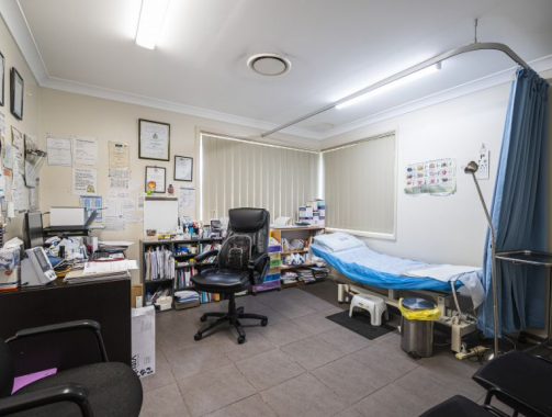
28 Cumberland Road, Ingleburn NSW 2565